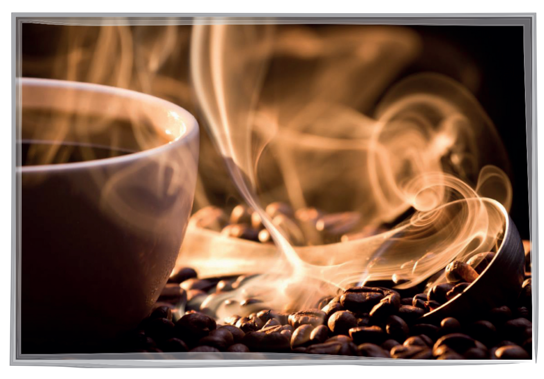
Prices include V.A.T.